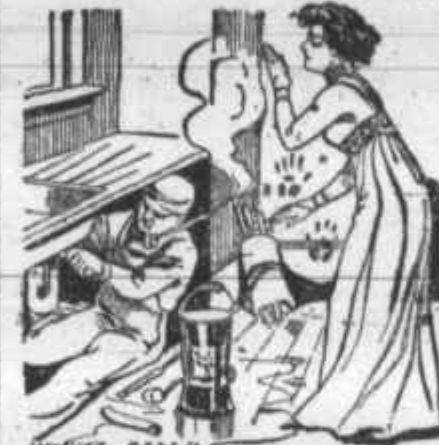
It's Not Our Way

of doing things when we go into your home to repair your pipes or do a plumbing job of any kind to litter up your floor with dirt. We are careful and clean about the work when either installing new plumbing or doing repairing of any kind. Our men are also trustworthy and careful and are all expert plumbers.