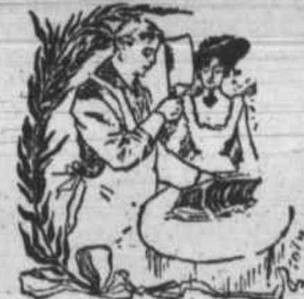
In The Cutting

of Roasts, Chops or Steaks we endeavor to please all customers. That we are successful is proven by the amount of business we do. If you are not one of our customers, you should send to us for a trial order for BEEF, VEAL, PORK or MUTTON and you will soon be convinced that what you get here is the best obtainable, and our prices are not as high as the quality deserves.