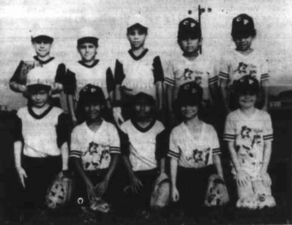
Tigers - Cowpokes all-stars