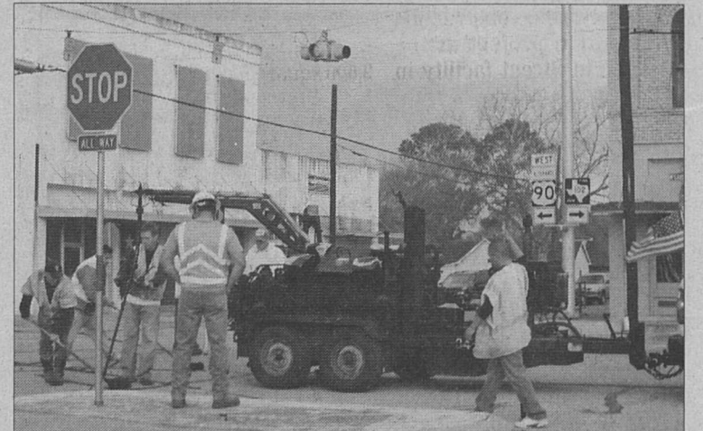
Contractors were downtown on Monday, Feb. 16 in Eagle Lake performing crack sealing on the roads. Texas Tree and Landscape Ltd. of China Springs was handling the work for the Texas Department of Transportation.

The board approved Reed and Associates as auditors at a cost of $17,500. It was noted that the cost has been the same for the last several years.