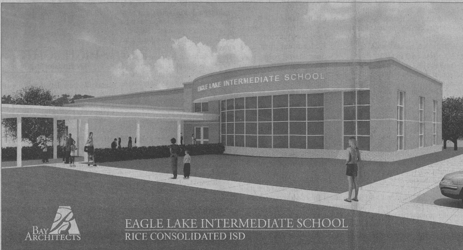
Pictured above is an architect drawing of the proposed new construction at the Tate Street facility in Eagle Lake. That facility will become Eagle Lake Intermediate School and will house fourth through sixth grades.